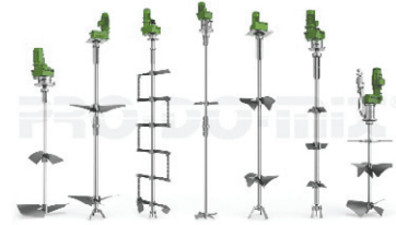
Manual & Electric Mixers